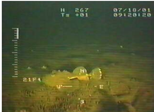
Goosefish Lophius americanus MH-3A post