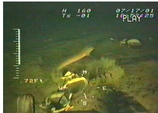
Ocean Pout Macrozoarces americanus MH-2C post