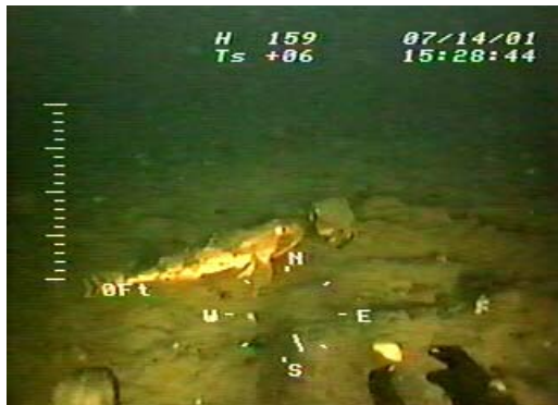
Sculpin Myoxocephalus sp. LT-3A pre