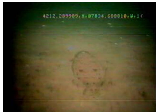
Four-spotted Flounder Paralichthys oblongus MH-2 pre