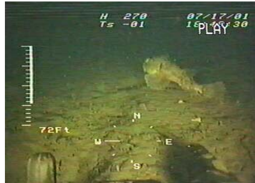
Sea Raven Hemitripterus americanus MH-2C post