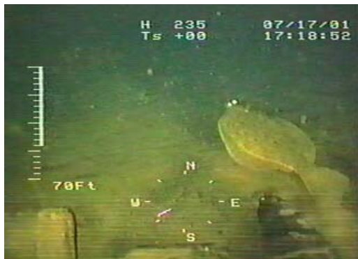
Winter Flounder Pleuronectes americanus MH-1C post