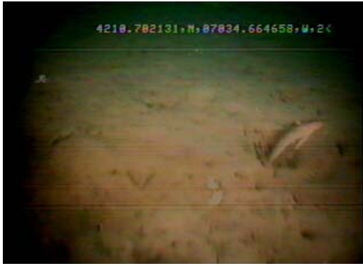
Red Hake Urophycis chuss in burrow LT-3A pre