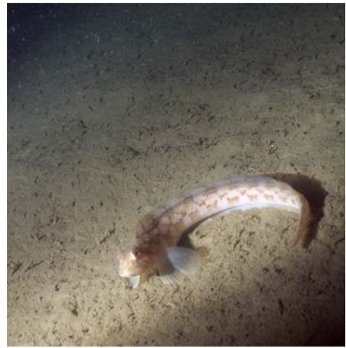
Ocean Pout Macrozoarces americanus