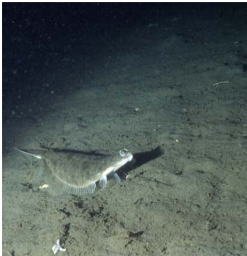
Winter Flounder Pleuronectes americanus