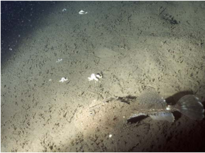
Goosefish Lophius americanus