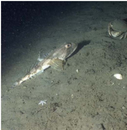
Sculpin Myoxocephalus spp.