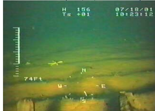
Deeper, up to six inch, trawl door furrows in the softer sediment at southern Mud Hole - MH-3A post (left) and MH-3C post (right)