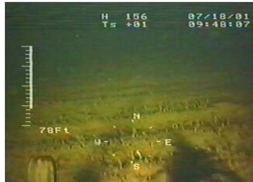
Exposed Bamboo Worm ( Maldanidae ) tubes at Mud Hole – left image (MH-3C post) and right (MH-3B post)