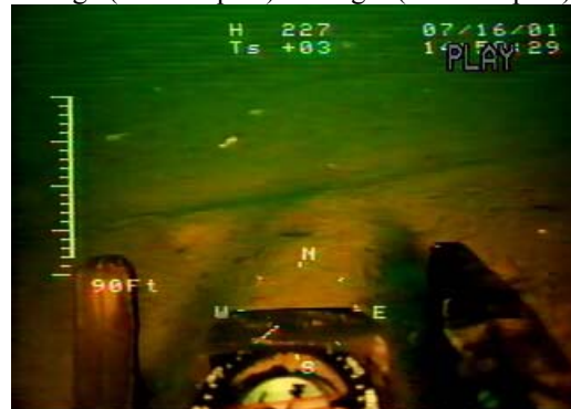
Shallower 2 to 4 inch deep trawl door furrows in the coarser sediment of southern Little Tow - left image (LT-3A post) and right image (LT-3B post)