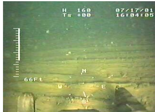
Shallow door impacts and smoothing of sediment at northern Mud Hole - MH-1C post (left) and MH-1B post (right)